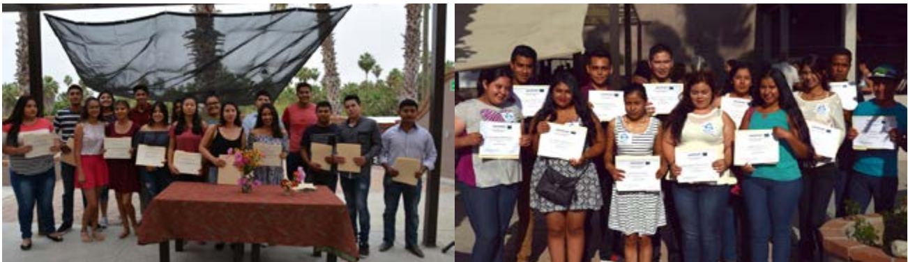
Some of the many Palapa Beca recipients.