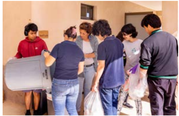
Materials Recycling Activities

A dedicated grant allowed us to hire an Art Program director. Our commitment to sustainability was recognized with the prestigious Zero Waste Agent designation, while the upgrade of our technology infrastructure allowed us to introduce digital literacy programs. These accomplishments were only made possible through the resources provided by the following partners and grantors.