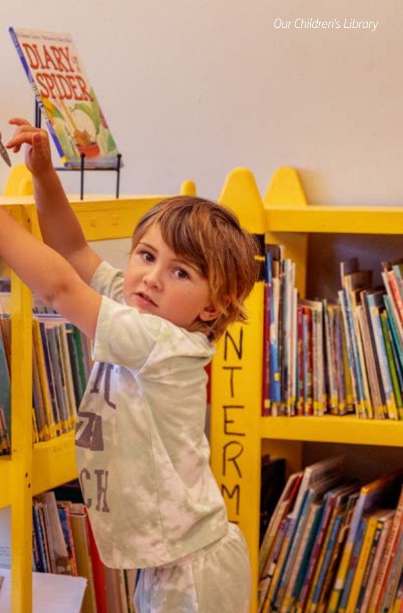
Our Children's Library