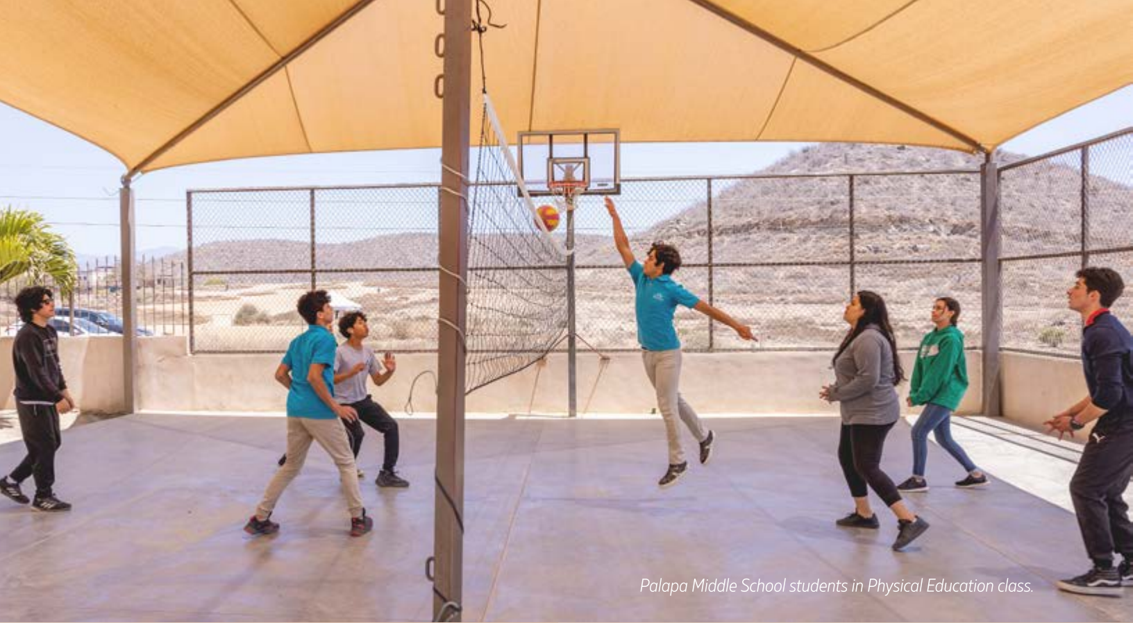
Palapa Middle School students in Physical Education class.