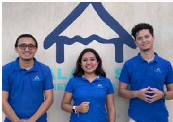
Our team of Co-Directors

It is worth mentioning that the talented team of teachers allowed us to have a remarkable academic advance, qualifying above the national average in the MejorEdu standardized test and contributing to the personal growth of our students. This all culminated in the joy of achieving 100% of high school graduates able to consciously decide their next step. The vast majority decided to continue with university studies while others have a solid plan for their future careers. The challenges were great, but with the push and support of the community, success was inevitable. Forward!