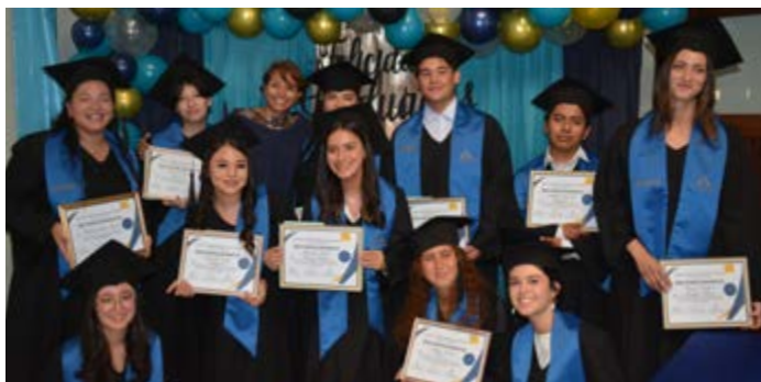
2023 Graduates of the Palapa Middle and High School