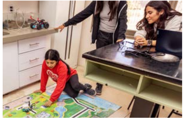
The Palapa School's Robotics Club

Through the dedicated efforts of our Partnerships and Grants Committee, we have secured a number of significant partnerships and grants. These propelled us toward making a lasting impact on the community. Some collaborations included expanding our Robotics Club, providing more students with access to STEM education, and fostering interest in technology and innovation.