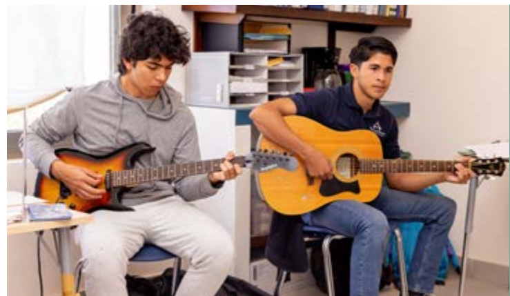
High School Music Club