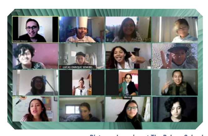
Distance Learning at The Palapa School

The Palapa School Vision is to be a sustainable, accessible middle school and high school in which educational programs empower choice-filled lives and create positive, transformational change for the youth of Todos Santos.